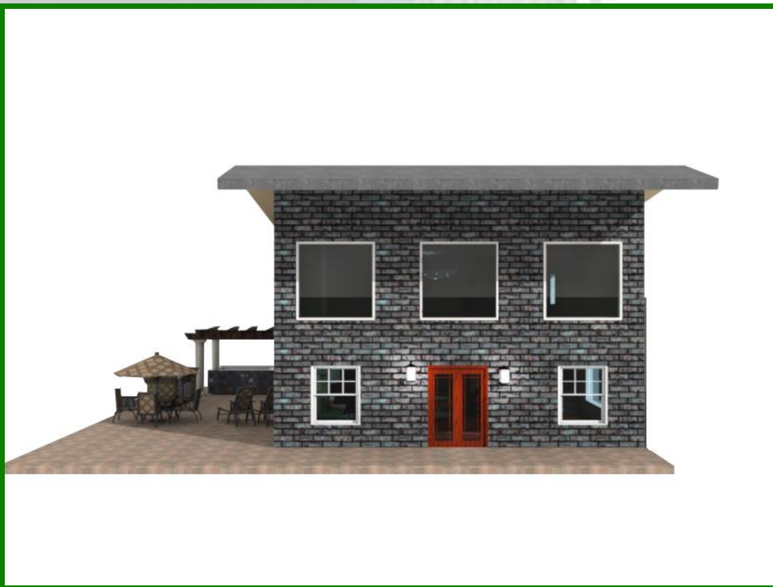
FRONT ELEVATION: TIME OF DAY: 7:45 P.M.

“Create a space to function as a vacation rental unit for up to two guests. This structure will depict modern interior and exterior styles and include high end finish materials and amenities. The interior will feature an open concept plan and include an open loft.”