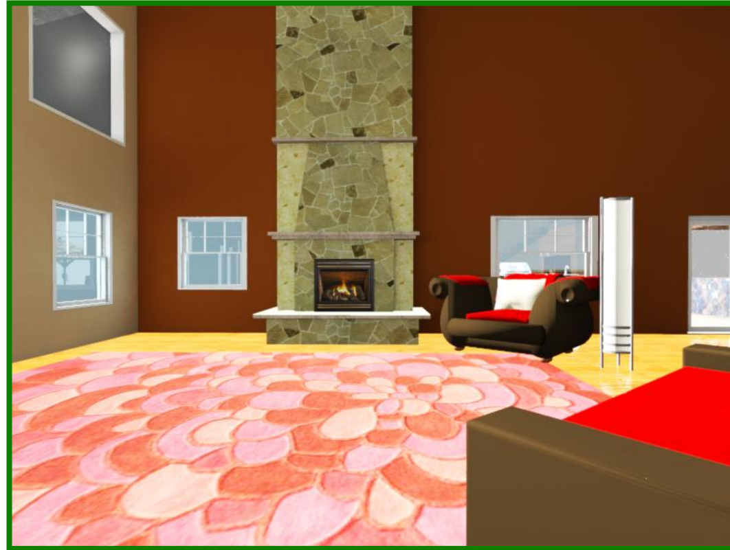
Interior Perspective from couch. Time of day: 6:00 a.m.