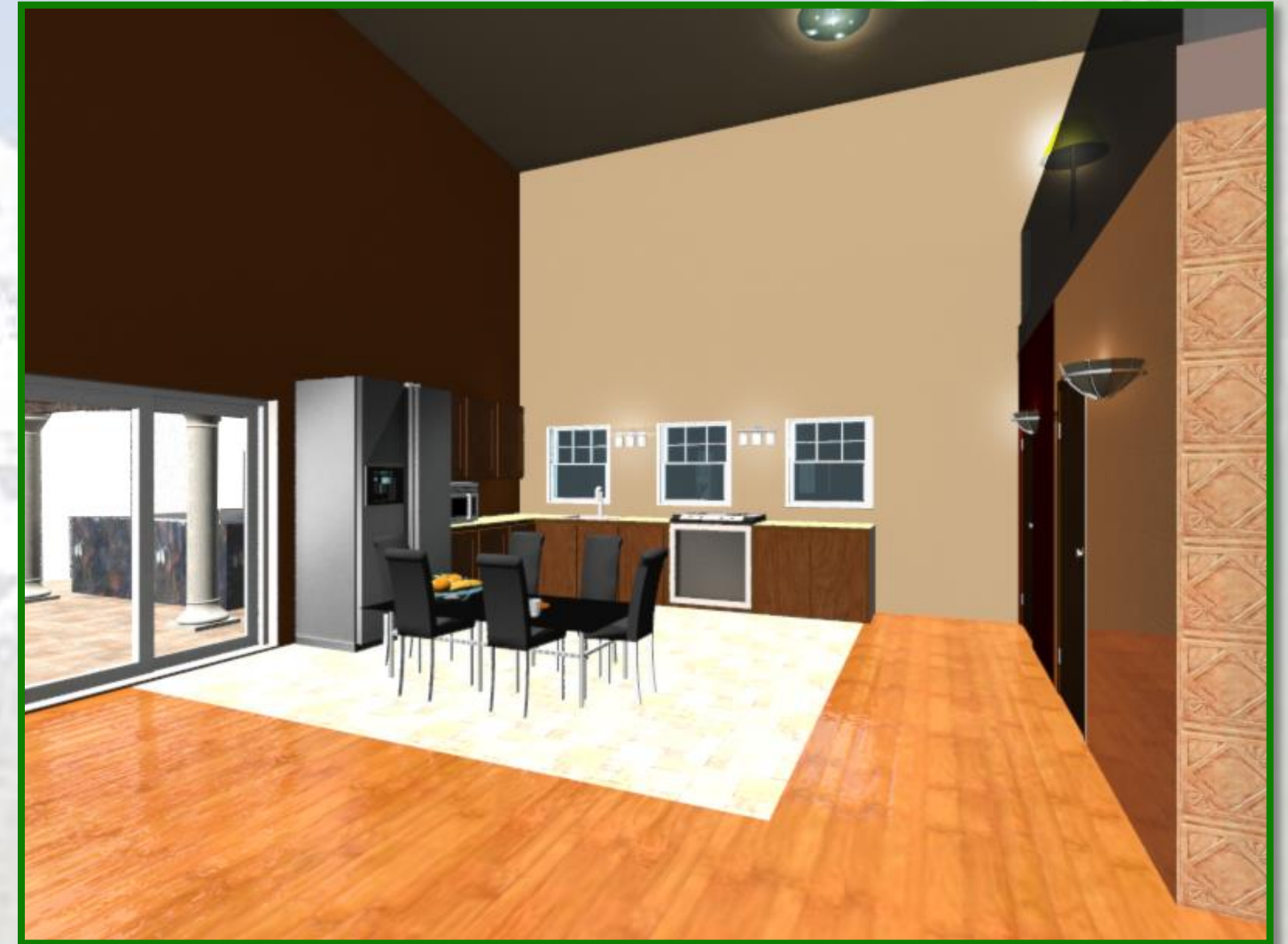
Interior Perspective from Living Area. Time of day: 4:00 p.m.