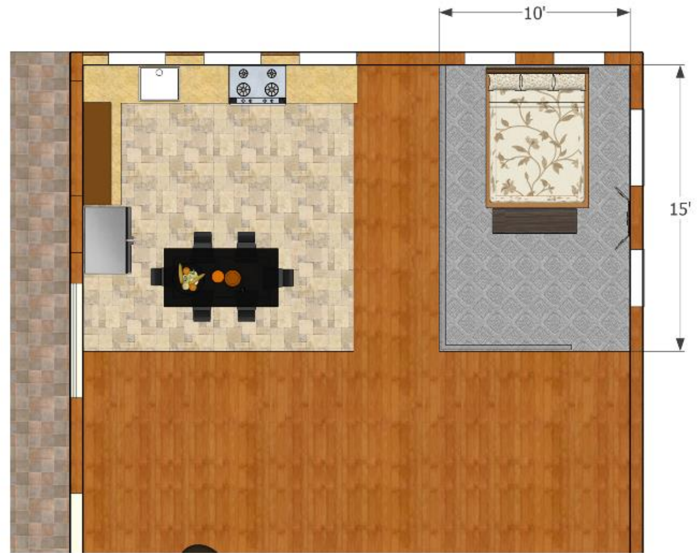
LOFT PLAN SCALE: 1/8" = 1'-0"