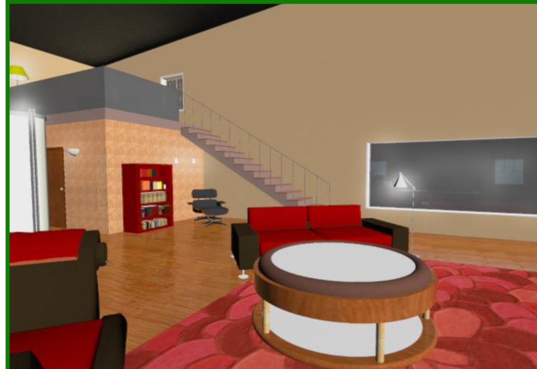
Interior Perspective from Fireplace. Time of day: 9:45 p.m.