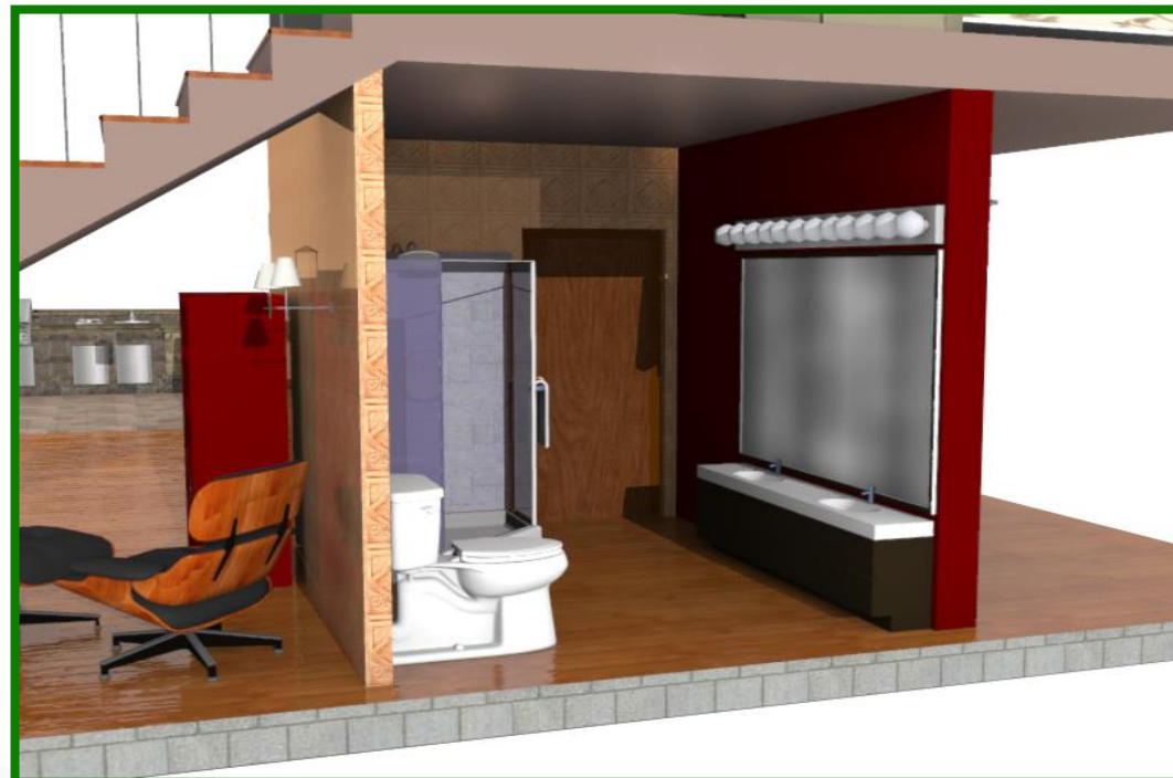
Exterior Perspective of Bathroom. Time of day: 12:30 p.m.