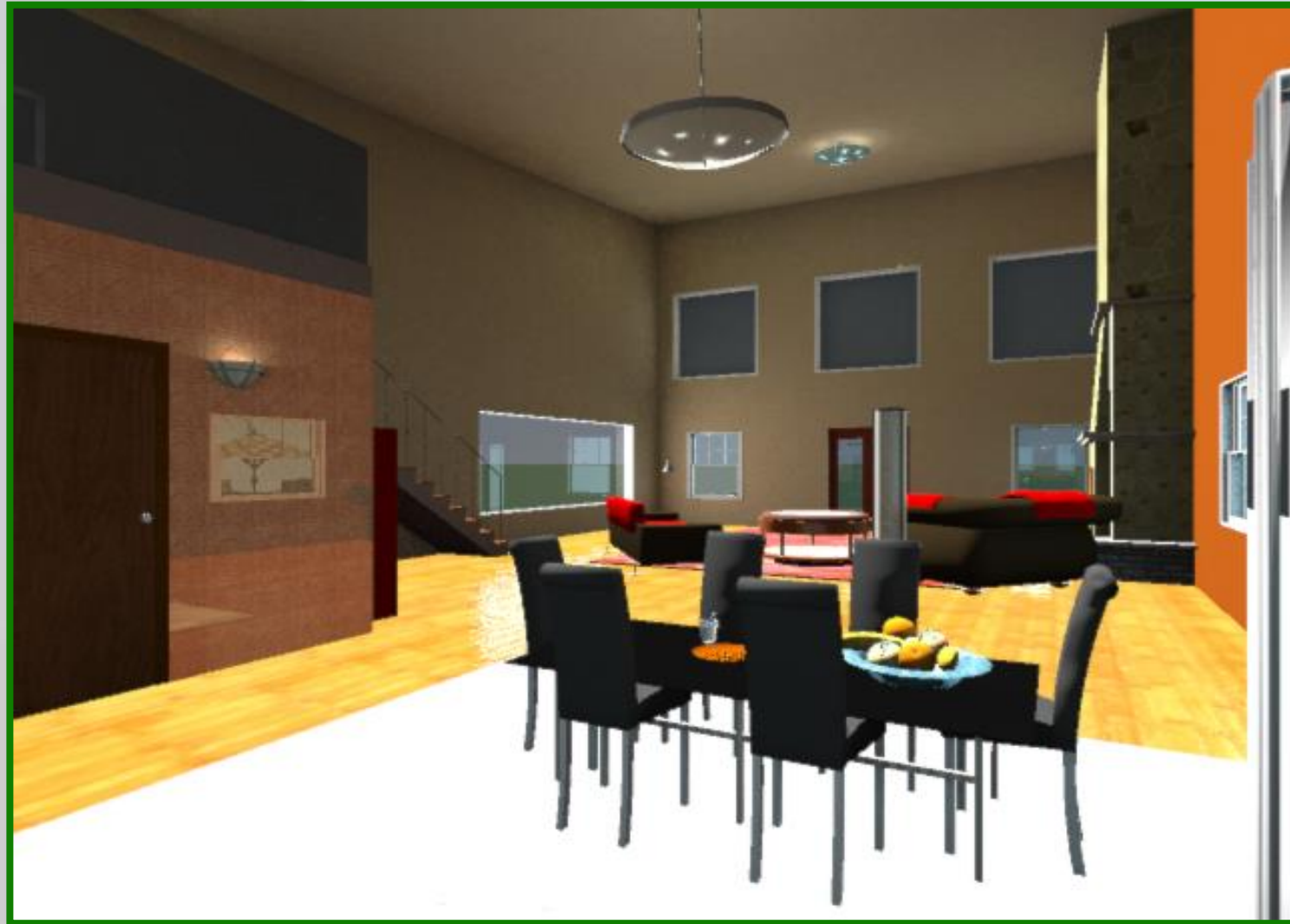
Interior Perspective from Kitchen. Time of day: 8:00 p.m.