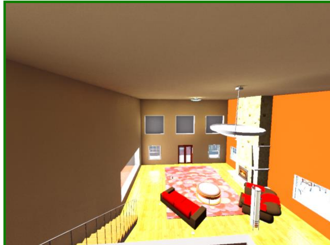
Interior Perspective from loft. Time of day: 8:00 a.m.